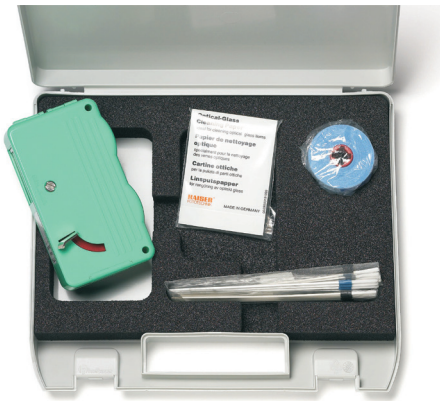
OCK-10 Optical Connector Cleaning Kit (accessory)